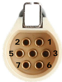
Channels 1, 2 and 3*